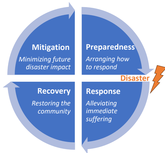
Figure 1.1.: The four phases of disaster operations management.

An example of a figure is given in Figure 1.1.