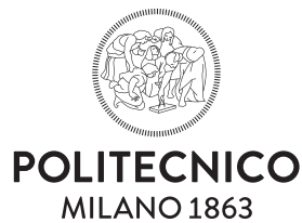
Figure 1.1: Caption of the Figure to appear in the List of Figures.

Thanks to the \subfloat command, a single figure, such as Figure 1.1, can contain multiple sub-figures with their own caption and label, e.g. Figure 1.2a and Figure 1.2b.