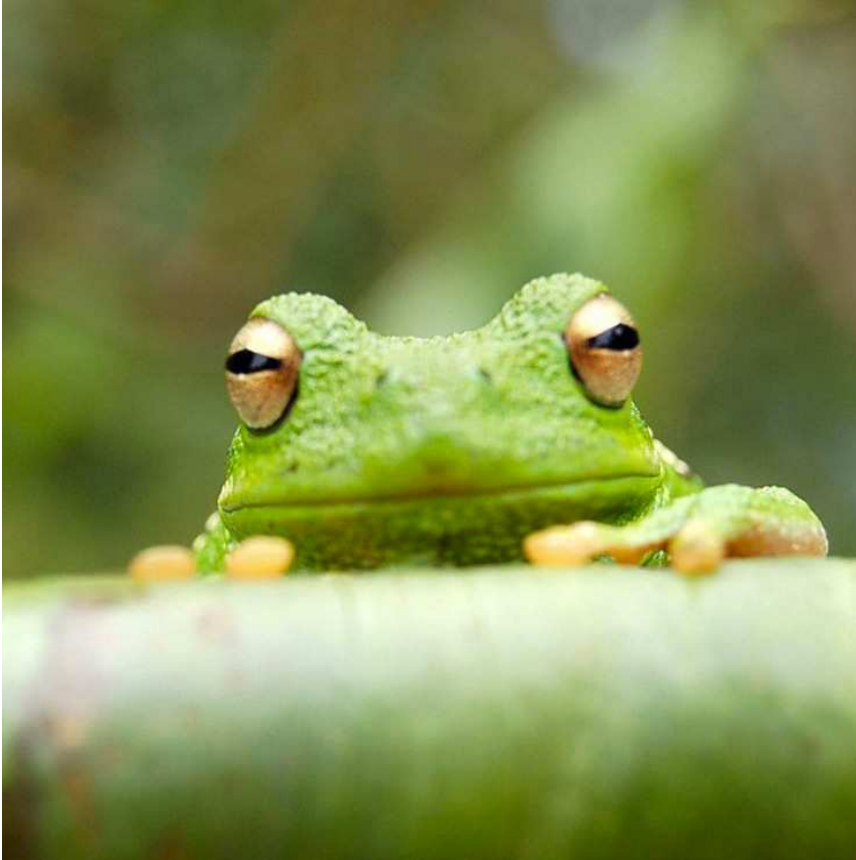
Fig. 2. This legend would be placed at the side of the figure, rather than below it.