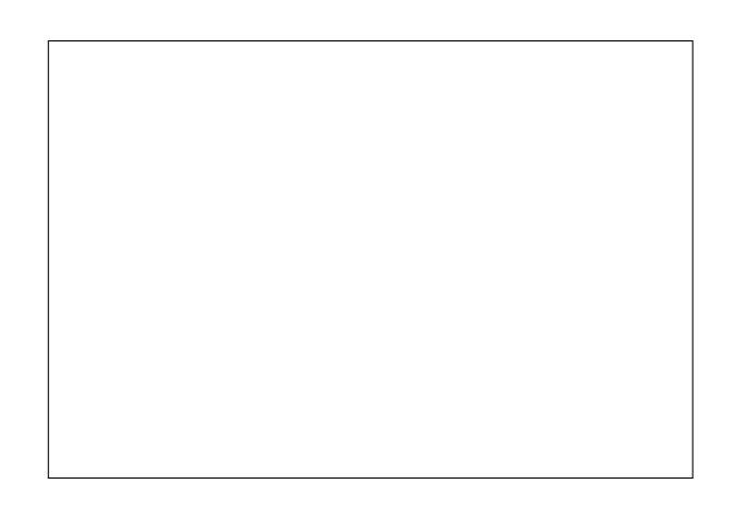
Figure 1. Example of caption. It is set in Roman so that mathematics (always set in Roman: B \sin A = A \sin B ) may be included without an ugly clash.

This is incorrect: "... subsequently developed by Alpher et\ al.\ [2]\ ... " because reference [2] has just two authors. If you use the \etal macro provided, then you need not worry about double periods when used at the end of a sentence as in Alpher et\ al.