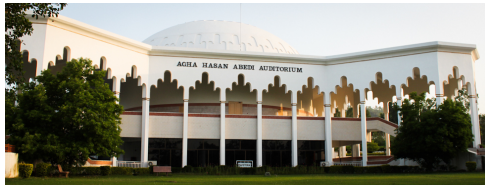
Figure: Agha Hasan Abidi Auditorium