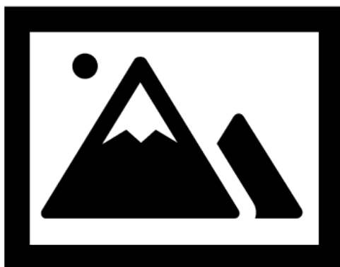
Figure 1: This is an example figure.

36 Figures should be called out within the text and numbered in the order of their citation in the text. 37 Every figure must have a descriptive title beginning with “Figure [Number] ...” All figure titles should be either a phrase or a sentence; do not mix the two styles. See Figure 1 for example.