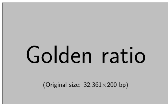
Figure 1: A figure with a caption that runs for more than one line. Example image is usually available through the mwe package without even mentioning it in the preamble.

graphicx package supports various optional arguments to control the appearance of the figure. You must include it explicitly in the L A T E X preamble (after the \documentclass declaration and before \begin{document} ) using \usepackage{graphicx} .