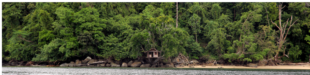
FIGURE 2. Example figure caption for a double-column image. Images that are wider than they are tall might be more readable as double-column figures, whereas tall images will likely take up too much page space.